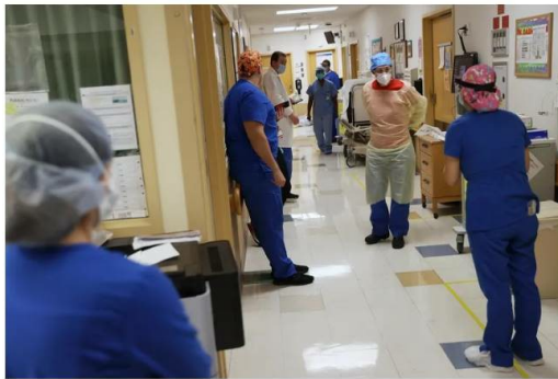
Nurses at Temple University Hospital, shown here in April 2020, will get the opportunity to earn bonuses for working overtime under a proposal by Temple management.

Thousands of relatively inexperienced nurses have received raises from area health systems in a bid to prevent them from leaving for lucrative sign-on bonuses at other hospitals.